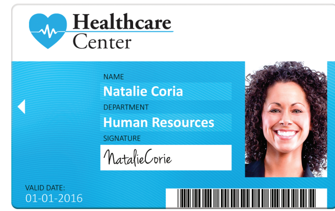
Printing, Encoding and Activation of a card can all be done with one print job in CardsOnline.

No longer a wallet full of different cards is required for entrance, registration, cash register and other applications. A single card can be used for all applications. Use the card to grant access to buildings and parking spaces, for printing and locker facilities. In addition, use the same card for payment at vending machines, or to pay for lunch at the canteen.