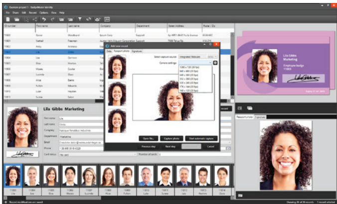
Managing and producing cards in BadgeMaker.

Company identity with a clear and professional card design is not the only feature Badgemaker offers, the software also brings accessible data management and effective card production.